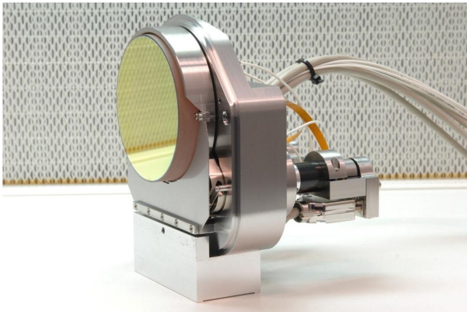
Figure 4: The first prototype of the FSM, standing upright on the laboratory table.