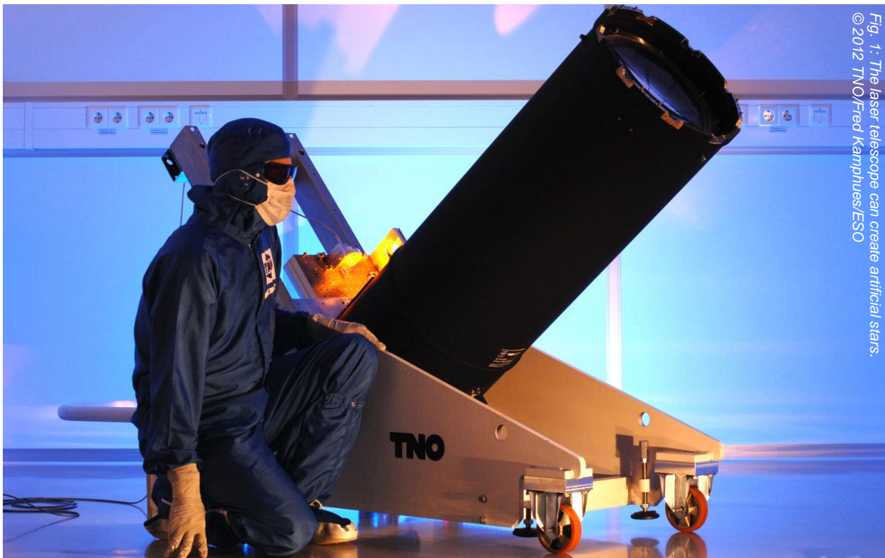
Fig. 1: The laser telescope can create artificial stars.