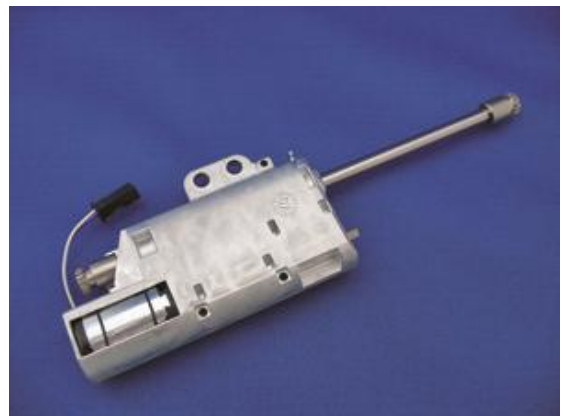
Figure 4: maxon motor AIRCAP® Drive