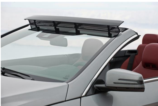
Figure 3: Mercedes-Benz Benz E-Class Cabriolet, E 350 CGI BlueEFFICIENCY, detailed view of extended AIRCAP®

As to acoustics and ganging, the drive fulfills the same high requirements, as Mercedes-Benz requires for interior passenger compartment instruments. Besides the high-end demands on power density, dependability and comfort, the drive also complies to the rigid constraints on optimized serial production. Thus, the entire drive assembly can be mounted into the windshield frame without the use of screws. Alike, the individual components, such as anti-vibration motor receptacle, motor, gear pinion, bipartite hull etc. are assembled with in an especially designed procedure.