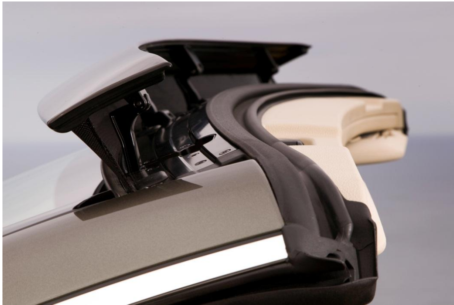
Figure 2: Mercedes-Benz E-Class Cabriolet with extended AIRCAP®

Result is a drive system that claims just 22 mm of installation height and drives the three outputs for bracing, adjustment of the lamella module and latching of the AIRCAP® in a fix, coordinated and synchronized ratio. In retracted position, the lamella module is being braced and interlocked flush to the car body's surface, in extended end position it is being mechanically interlocked. While being deployed, the drive overcomes wind ram pressures well beyond 250 km/h (155 mph) by torques of up to 7 Nm.