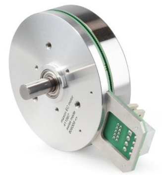
Figure 2: EC 90 flat brushless motor with MILE encoder.