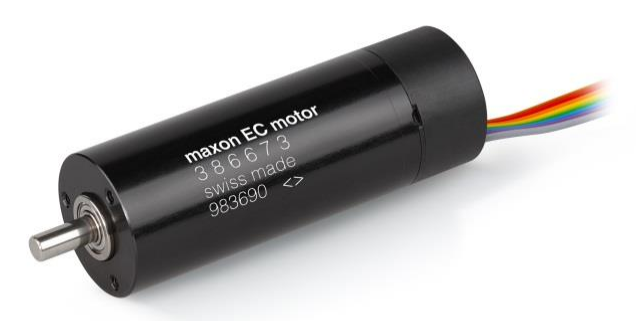
Figure 3: The maxon EC 22 brushless motor (100 W) is used in Kenshiro.

Author: Anja Schütz, Editor, maxon motor ag Case study: 3452 characters, 663 words, 4 figures